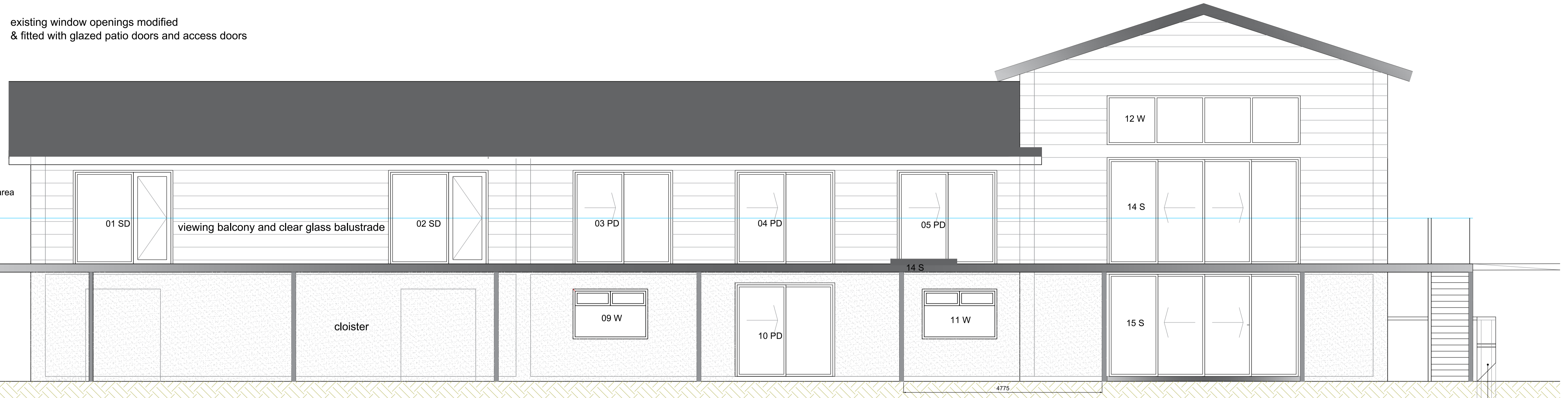
SOUTH EAST ( FIELD) ELEVATION

existing window openings modified & fitted with glazed patio doors and access doors